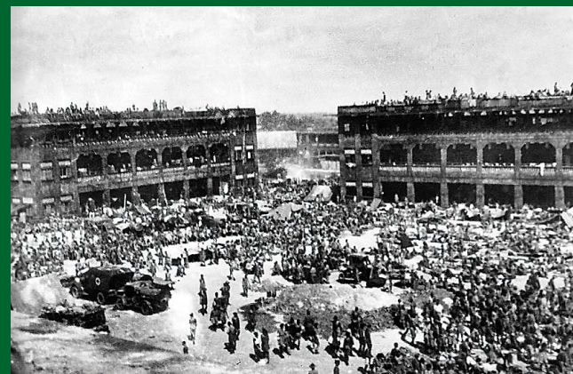
A view of the Western end of Selarang Barracks Square after the Japanese barred all 15,000 British and Australian POWs from their barracks until they signed a 'non-escape' agreement, September 1942.