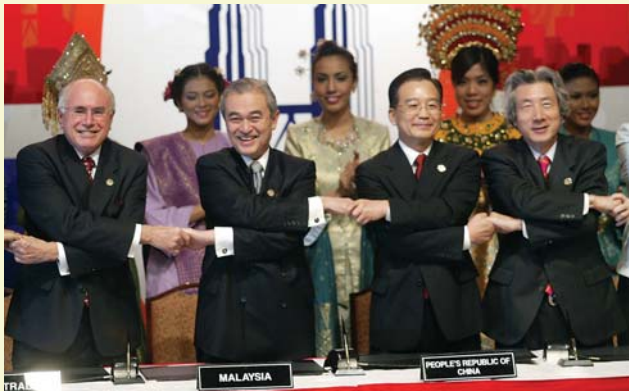
Australian and Japanese Prime Ministers at the First East Asian Summit at Malaysia, December 2005. They are standing respectively to the left and right of the Prime Minister of Malaysia, Abdullah Badawi, and the Prime Minister of China, Wen Jiabao. They are holding hands with all the other Summit leaders in an "Auld Lang Syne" gesture of goodwill.

Organized by: Australia-Japan Historical Photo Exhibition Committee The 2006 Year of Exchange Japanese Executive Committee