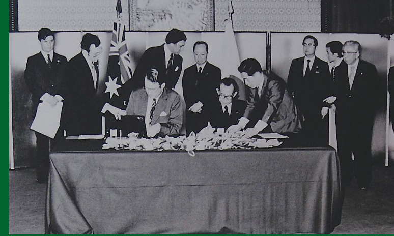
Australian Prime Minister Fraser and Japanese Prime Minister Miki signing the Treaty of Friendship and Co-operation in Tokyo, 16 June 1976

Australia-Japan Historical Photo Exhibition 2006 Australia-Japan Year of Exchange