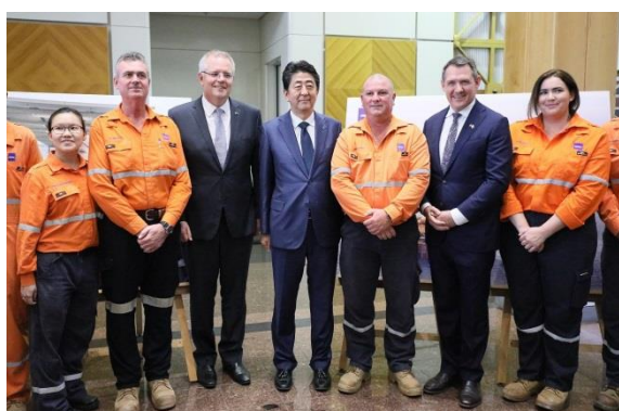
Reception given by Northern Territory Chief Minister Michael Gunner