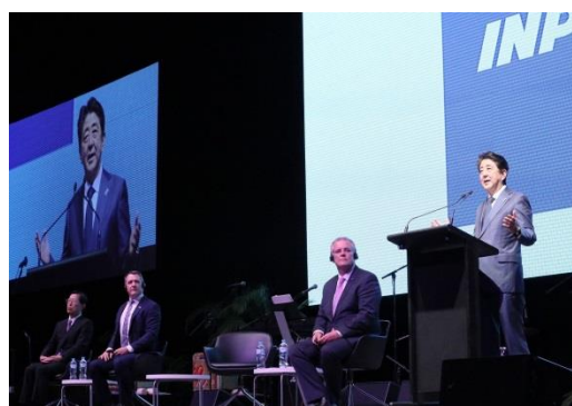
Remarks at the INPEX Gala Dinner