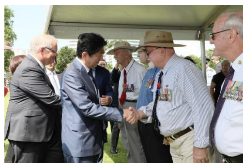
Meeting with war veterans