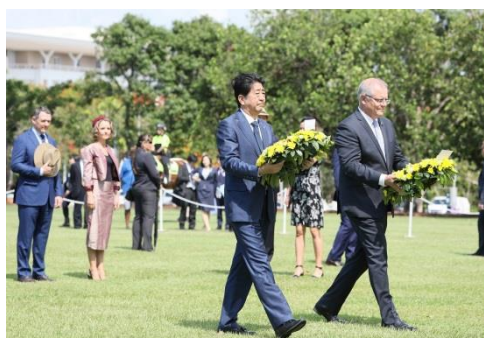
Wreath laying at Darwin Cenotaph

Please also allow me to take this opportunity to share with you some photos of the occasions which took place during the visit.