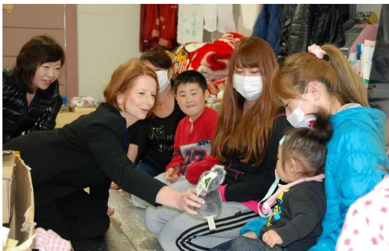
Former Prime Minister the Hon. Julia Gillard visit to Minami Sanriku, April 2011

In Spring of this year, former Prime Minister of Australia the Hon. Julia Gillard was awarded the Grand Cordon of the Order of the Rising Sun, while former Japan-Australia Parliamentary Friendship Group Chair the Hon. Warren Entsch MP was awarded the Order of the Rising Sun, Gold and Silver Star. The joy at which both of these recipients received notification from myself of their selection made me both happy and left a deep impression on me.