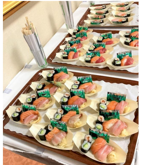
Some of the meals on offer at award receptions

As the COVID-19 pandemic has subsided in Canberra, a decision was made that the time had come to celebrate in earnest. After consulting with all three recipients on their preferred method for receiving their award (a meal involving small numbers of people, a reception