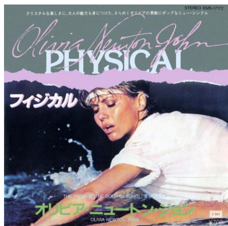
(From top) CD cover of “I Honestly Love You”, “Take Me Home, Country Road”, and “Physical”