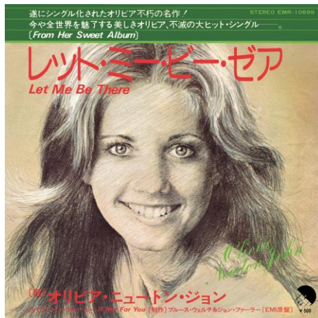
CD cover of “Let Me Be There”

I then resolved to fully commit myself to studying the English language!