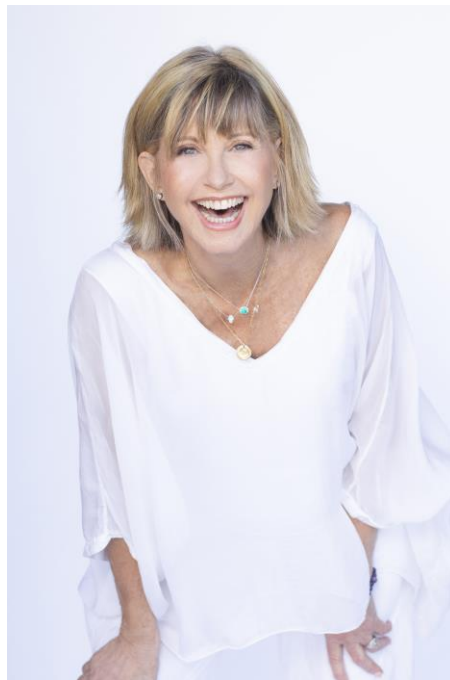
Olivia still fascinates us fans with her unchanging loveliness.

I am very much looking forward to holding the conferral ceremony of the decoration in Australia, which Olivia calls home, when travel restrictions caused by the COVID-19 pandemic are eased.