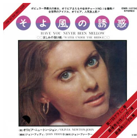
CD cover of “Have You Never Been Mellow”

The treasured hits that remain in my heart aren't limited to these ones alone. There was “Don't Stop Believing” which I listened to over and over again on days when nothing was going my way. There was “Take Me Home, Country Road”, which spent 15 weeks at No.1 on the Oricon Western Music chart ( note: Oricon Inc is a Japanese company offering music news services, including rankings ). Another was the song of innocent but painful and sincere confession “I Honestly Love You”. There was “Hopelessly Devoted to You”, the love song that made me so envy her on-screen boyfriend John Travolta. “Physical”, which was a complete change in tone, also brings out the nostalgia in me.