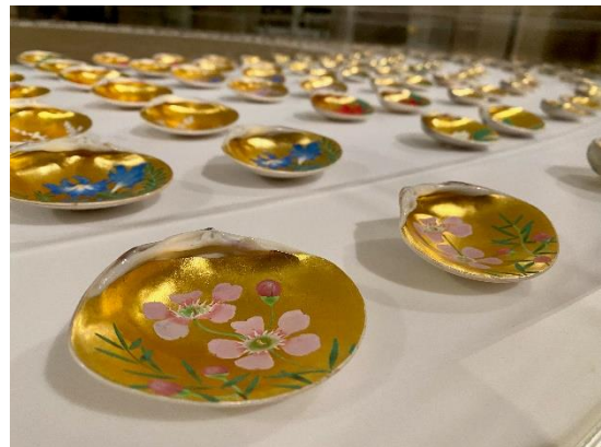
The exhibition of kai-arwase