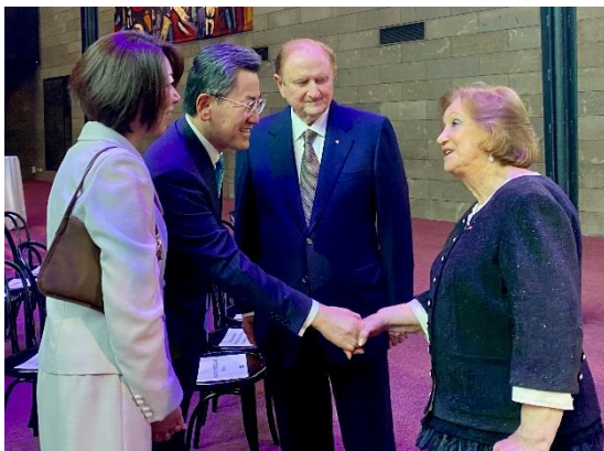
Shaking hands with the Gandels

Not only was the range of the collection overwhelming, so was the exquisite beauty of the picturesque designs depicted on the shells laid with gold leaf, and which took as their motif the flora of Australia. These designs show traditional Japanese art can thus be passed on to current and future generations. I was deeply touched to see the 'good old traditions' of Japan being so tirelessly carried on here in Australia (my speech can be read here ).