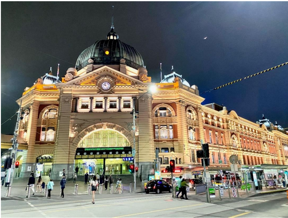
Melbourne's Flinders Street Station

I visited Sydney two weeks in a row, last week and the week before. This week I made a trip to Melbourne. Let me report to you about this trip.